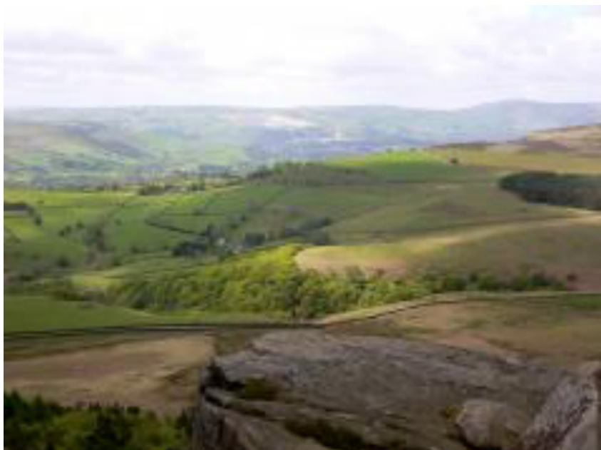
Views from the Sheffield Country Walk